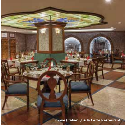
Limone (Italian) / A la Carte Restaurant