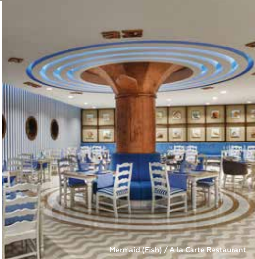
Mermaid (Fish) / A la Carte Restaurant