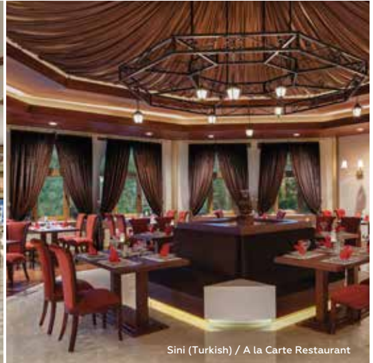
Sini (Turkish) / A la Carte Restaurant