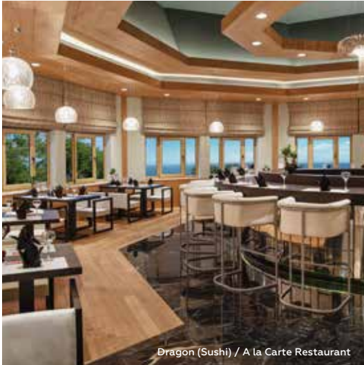
Dragon (Sushi) / A la Carte Restaurant