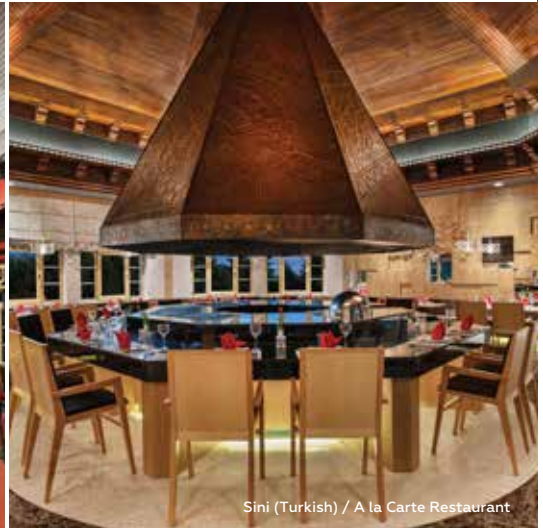
Sini (Turkish) / A la Carte Restaurant